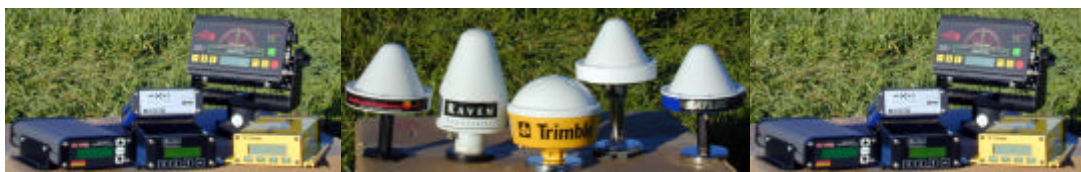
Figure 2. GPS antennas and receivers.

GPS receiver update rate is the number of times a GPS receiver sends the position information per second. An update rate of 1 Hz will send out the position information once every second, a 5 Hz GPS receiver will send out the position information five times per second. Most guidance systems need an update rate of 5 Hz to operate effectively. A GPS receiver with an update rate of 1 Hz may not provide enough data to operate a guidance system effectively due to the speed of information being processed.