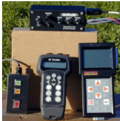
Figure 4. Controller and Data logger

The controller is used to select menu options in the guidance system. Along with the controller, a data logger, visual display or sound device can be an important attribute to a guidance system for custom applicators or producers that need to document when and where a product was applied. Some of the systems have a visual screen along with the data logger to provide a visual representation where the material was applied (Figure 4). Some data loggers can also mark field attributes such as rocks and drainage areas, or save them for future reference. The controller and data logger may be combined into one unit or two separate pieces of equipment. The data logger may also have a visual display. A sound device may inform the user where to steer, where product was applied, or hazards located in the field.