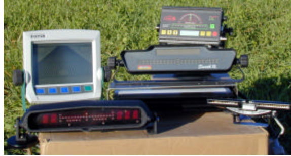
Figure 3. Light bar and Visual display

The controller is used to select menu options in the guidance system. Along with the controller, a data logger, visual display or sound device can be an important attribute to a guidance system for custom applicators or producers that need to document when and where a product was applied. Some of the systems have a visual screen along with the data logger to provide a visual representation where the material was applied (Figure 4). Some data loggers can also mark field attributes such as rocks and drainage areas, or save them for future reference. The controller and data logger may be combined into one unit or two separate pieces of equipment. The data logger may also have a visual display. A sound device may inform the user where to steer, where product was applied, or hazards located in the field.